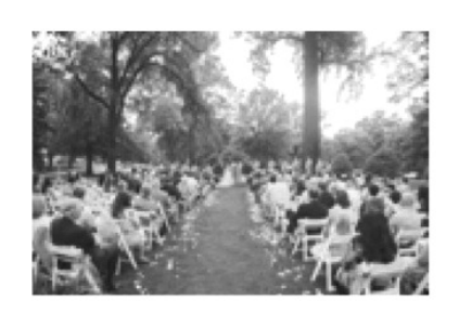
Amber Teegen – June 4, 2016